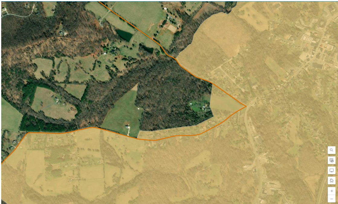
Amherst Town Extension – Extend existing CVTPO (orange line) to pick up homes along Sunset Drive, better align with Town Boundary. CVTPO Extension = Mustard Area